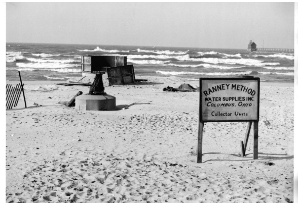
Pictured above is the City of Grand Haven's installation process of the retired 1950's Ranney Well Collectors (one of three). Designed to deliver 7 million gallons per day (MGD), but only could deliver 5 MGD. All three wells were removed in 2002.

Crockery Township is pleased to present this year's Drinking Water Quality Report. This report is designed to inform you about the quality of the water we deliver to you everyday. Our constant goal is to provide you with a safe and dependable supply of drinking water. We are committed to ensuring the quality of your drinking water.