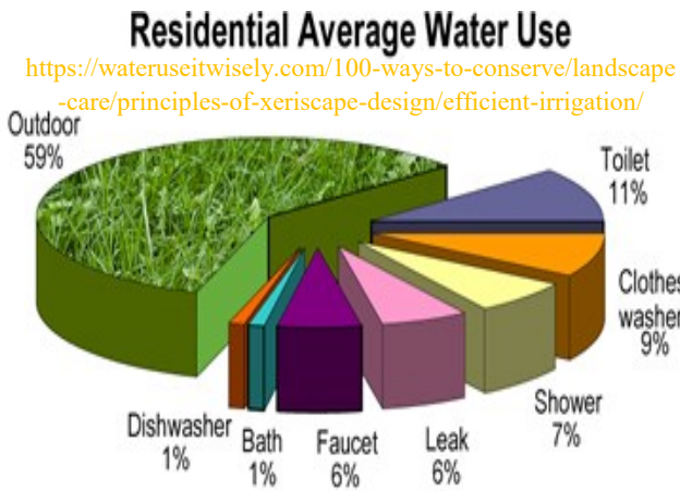
Source: American Water Works Association Research Foundation, End Uses of Water

For more PFAS information go to: http://michigan.gov/pfasresponse